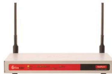
Firetide HotPort Indoor Mesh Node

Firetide HotPort™ mesh nodes are the building blocks of a Firetide instant wireless mesh network. After being plugged into an AC power source or a battery back-up system, HotPort mesh nodes automatically locate each other to create an extensive wireless mesh backbone for transporting multimedia traffic. And unlike fixed wireless technology, if a link is blocked or if a node is removed, the Firetide mesh network instantly reroutes traffic to assure maximum availability and reliability.