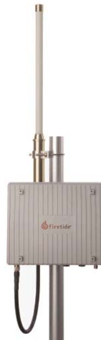
Firetide HotPort Outdoor Mesh Node

In addition to IP cameras, the Ethernet ports of a HotPort mesh node enable many other network devices such as sensors, printers, and computers to be connected to the wireless mesh for operation virtually anywhere, indoors and outdoors, without the need for backbone wiring. The entire mesh network can be managed remotely using Firetide's HotView mesh management software so a single staff member can easily monitor and manage every node from one location.