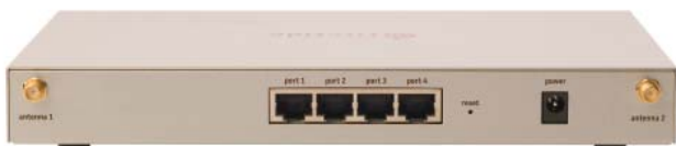
Firetide HotPort wireless mesh nodes provide standard Ethernet ports so IP cameras and wired Ethernet devices can operate on a wireless mesh network.

The best solution is a Firetide™ High Performance Mesh Network™. The Firetide mesh provides standard Ethernet ports on every wireless node, so virtually any enterprise grade IP camera can connect to the wireless mesh network. This capability means many more camera choices are available, and it also allows the seamless extension of networks that may already be in place. The Firetide mesh provides substantial bandwidth capable of supporting many simultaneous video streams. Traffic prioritization ensures smooth, jitter-free images at high frame rates, and because the Firetide mesh is not an open network, it doesn't have any of the security concerns associated with Wi-Fi networks.