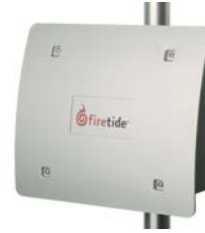
Removable sun shield