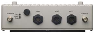
Lower Panel Connectors